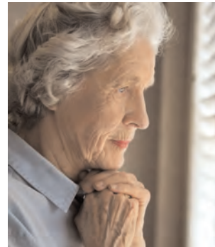
Grants from Donor-advised Funds helped the Alzheimer Society of Ireland, both nationally and locally.

The Drumkill Day Centre in Threemilehouse, Co. Monaghan received a small grant of €1,500 from the Co. Monaghan Fund in 2007. With this grant, the centre, in conjunction with the Alzheimer Society of Ireland's local branch, was able to increase the level of respite services from two to three days per week. The centre now provides services to older people with dementia each Tuesday, Wednesday and Friday.