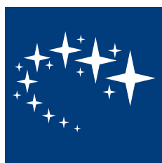
Patron: Her Excellency, Mary McAleese, President of Ireland