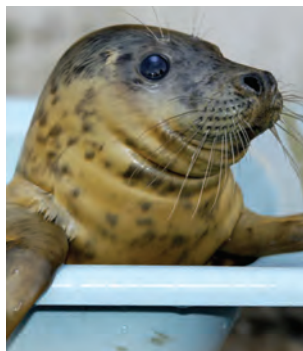
Irish Seal Sanctuary - one of the many seals that was cared for at the sanctuary.