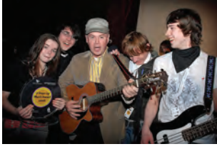
Minister of State at the Department of Community, Rural and Gaeltacht Affairs, Pat Carey with Youth Work Ireland participants.