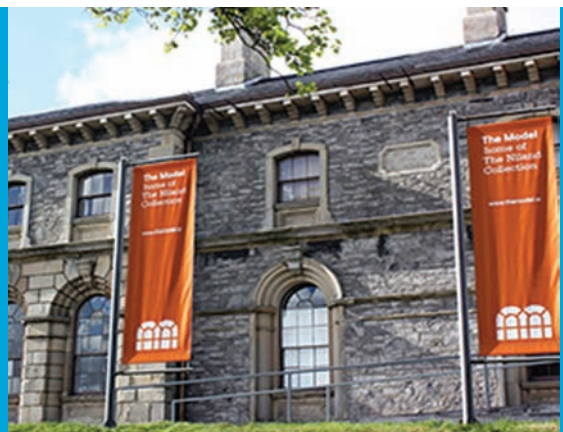
The Model Arts Centre in Sligo.