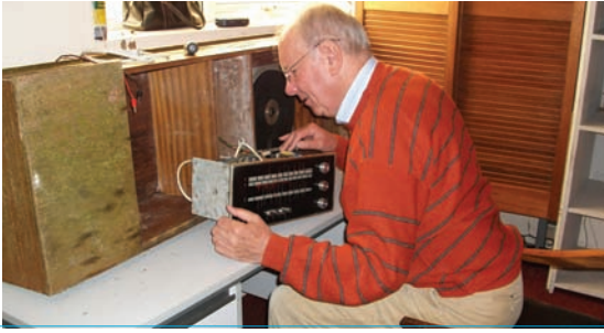
A Project of Bray Active Retirement Project called An Bothán where 20 men meet every week to share and teach each other skills such as wood carving and turning, ornamental glass cutting and radio restoration.

health and migrant communities. Underpinning the strategy is a strong commitment to shared learning with grantees to optimise the impact of our grants on the ground and to ensure ongoing evaluation and learning from our grant-making. The final tranche of the previous Grassroots Grants were distributed in the first quarter of 2013, followed by two Rounds of Caring Communities.