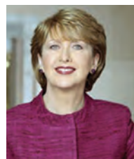
Our Patron, President Mary McAleese