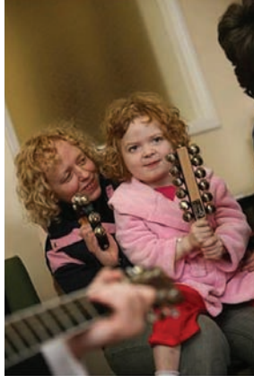
The grant will allow talented musicians visit the three main children's hospitals in Ireland.

Each monthly visit will include a workshop in each hospital as well as ward visits to bring music to those in intensive care and acute wards that cannot visit the playrooms or schoolrooms during the workshops. Each hospital will be presented with an instrument box, iPod with speakers as well as specially selected CD's and music storybooks, so that children can continue to explore the instruments and their sounds with their play therapists.