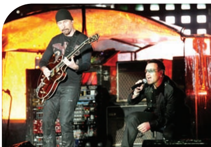
U2 were given the National Philanthropist of the Year Award