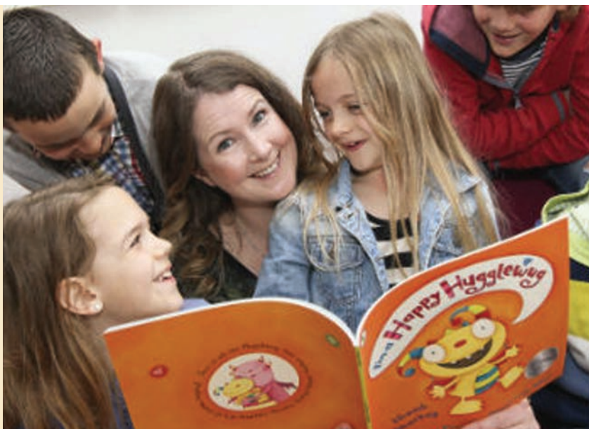
Literacy and literature at The Ark, with a programme of literature-based events for schools, families and teachers.